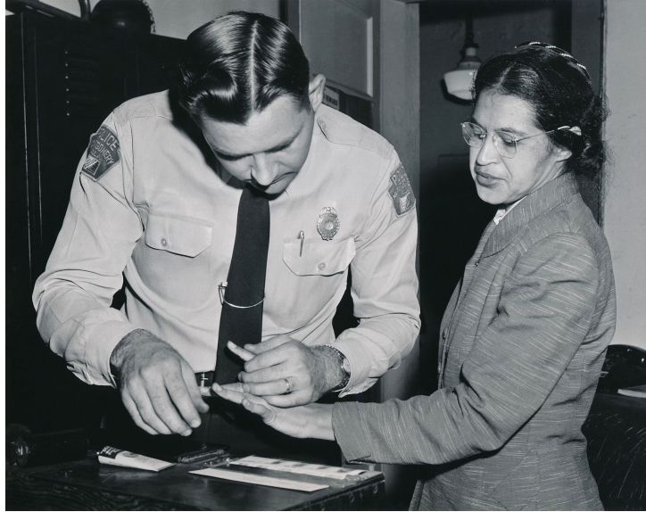
Rosa Parks - Public Domain Image

Directions: Compute the answers to the following questions